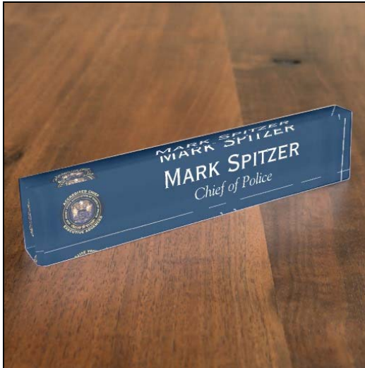
ACE-COP Advanced Sample Plaque (Name and Chief of Police)

MAIL OR FAX FORM TO: NJSACOP, 751 ROUTE 73 NORTH, SUITE 12, MARLTON, NJ 08053 FAX: 856-334-8947