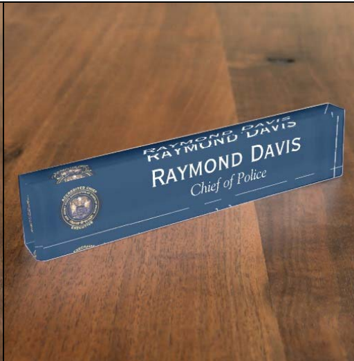
ACE-COP Sample Plaque (Name and Chief of Police)